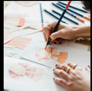
06 CREATIVE SERVICES