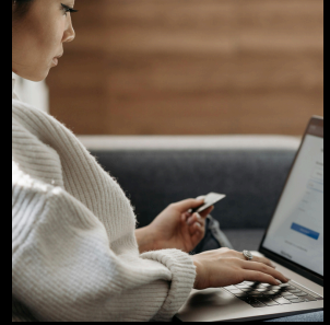
03 CUSTOMER SERVICE