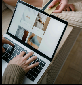
02 DIGITAL MARKETING