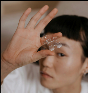
04 MARKET RESEARCH