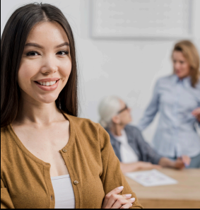
01 CORPORATE TRAININGS