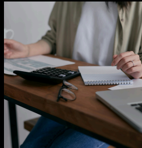
05 TALENT-ON- RETAINER